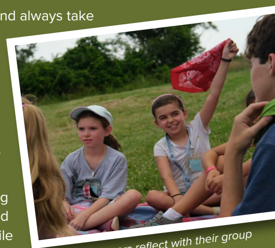
Campers reflect with their group

Aftercare may be selected during camp registration. This extended camp day is full of active fun while allowing families a more convenient pick-up time.