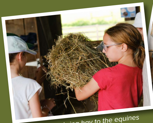
Campers bring hay to the equines

Campers work together as a team to feed, water, and clean the stalls of our friendly farm animals. Chef Camp focuses their attention on harvesting from the garden, while Wilderness Camp and Explorers skip chores to head out on the trail.