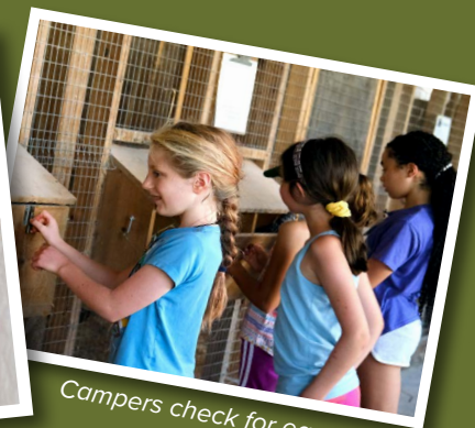
Campers check for eggs

Our afternoon activity blocks are carefully scheduled to provide hands-on learning and fun experiences. We mix things up each day with a variety of learning activities, animal interactions, crafts, and dedicated times for exploration and discovery. Campers may plant seeds, groom our miniature donkey, explore the pond with dip nets, build shelters in the forest, or learn about pollinators in our children's garden!